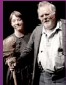
Mad River Theater Works Freedom Riders