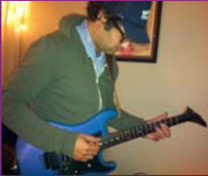
Miles of Wire Rock

Get the latest event information at theHett.com | Follow us on Facebook and Twitter