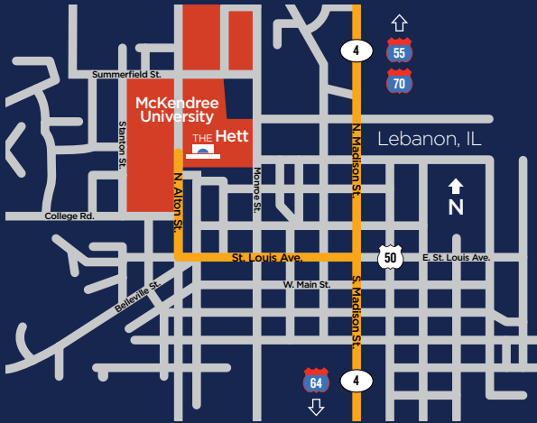
City of Lebanon