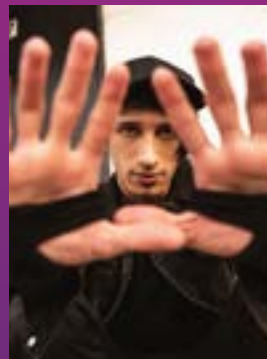
REZA Homecoming Weekend Show