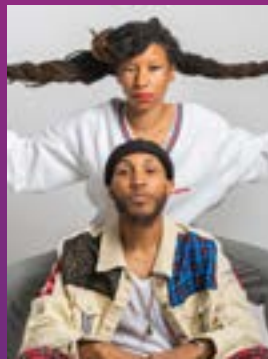
The ReMINDers Hip Hop Culture 101