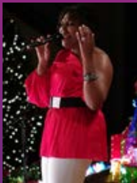
United States Air Force Band of Mid-America Holiday Concert

Educational and study-guide materials are available. Visit theHett.com under Upcoming Events/Arts Education for more information.