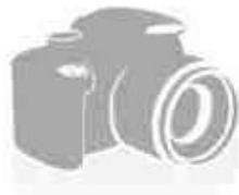
Valerie Sorondo Group 5 VOS 227