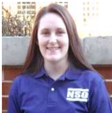
Faith Maag Group 20 CAR 304