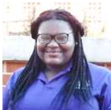
Ebony Luster Group 6 PAC 222