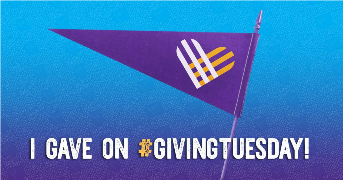
"I Gave" Graphic for Twitter Post: