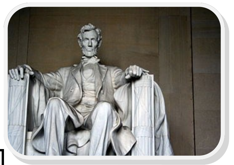
Lincoln Memorial, Washington, D.C.